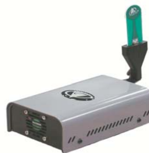
Time Domain's PulsON 210™ RD is a single UWB radio, comprised of a UWB module, a RF module, and an Application Module.

When you're ready to start developing demonstrations or prototyping products, you are ready for Time Domain's PulsON 210 Reference Design (P210 RD). At its heart, the P210 RD is driven by Time Domain's P210 Integratable Module (IM), a highly flexible, easy to integrate UWB engine. The P210 RD adds an example customer interface module to the IM, encloses the electronics in a robust housing, and comes with a comprehensive software and documentation package. With the detailed documentation, the P210 RD serves not only as the perfect prototyping tool, but includes a hands-on tutorial on the integration of the P210 IM.